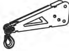
Crane boom tip