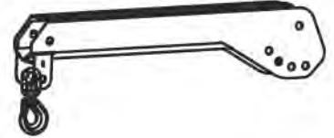
Manual JIB extension